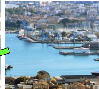
The main entrance of the Port of Palermo (shipping connection to Naples, Genoa, Cagliari,...; 5 min from our apartment)