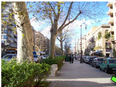
The luxury shopping street Via LIBERTÀ (4 minutes walking from our apartment)