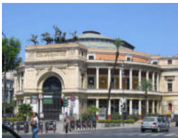
The TEATRO POLITEAMA (3 minutes walking from our apartment)