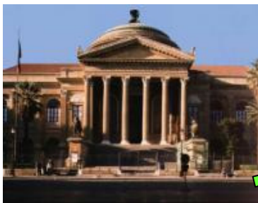
The TEATRO MASSIMO (less than 10 min walking from the apartment)