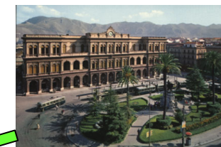
The Palermo Central Rail Station